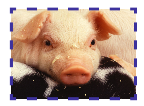
The pig is identified with ear notching or ear tags and vaccinated.

Can you figure out the correct order of a market pig's journey? There's one step missing in this pig's journey. Put the pictures in the correct order and fill in the missing step.