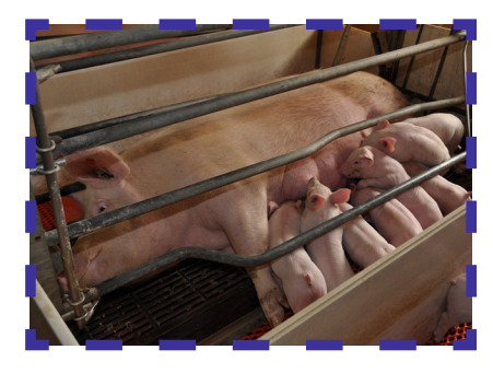
The pig is born in a "farrowing crate" to keep the sow and the piglets safe.