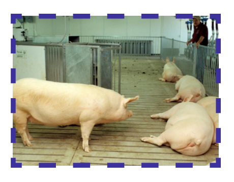
The pig is moved to a finishing barn until it weighs 280 lbs.