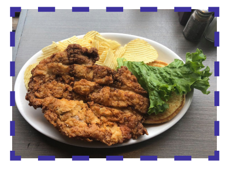
Consumers enjoy their pork at home and in restaurants.