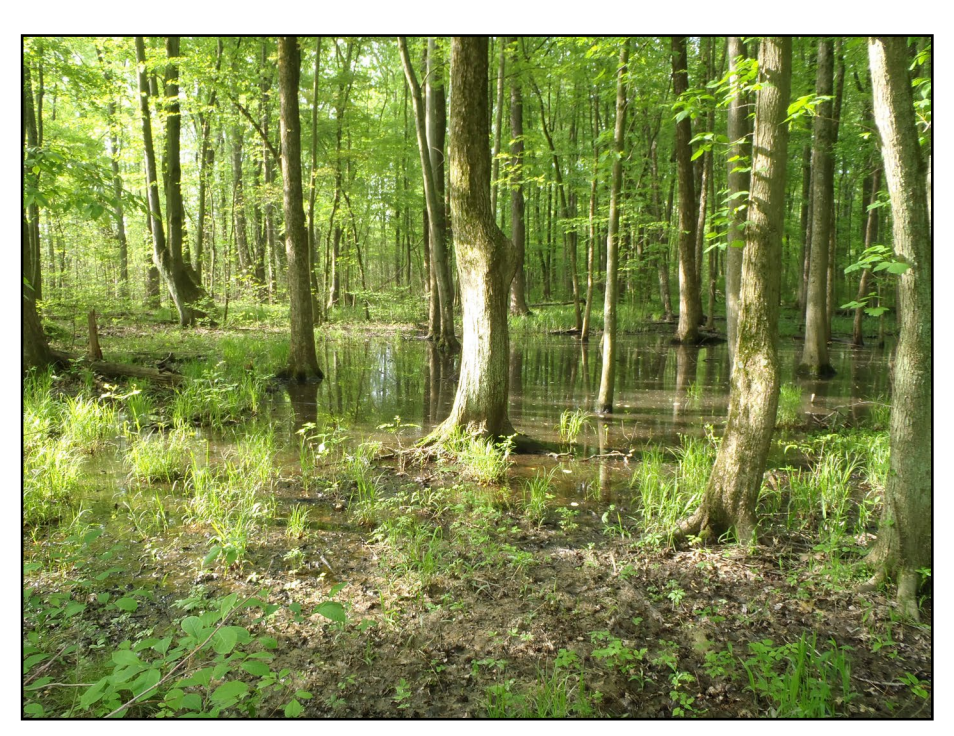
Wetland image courtesy of IDEM