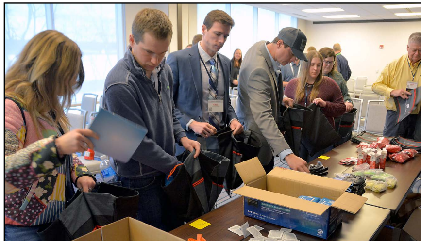
Following the "Don't Get Blown Away by Severe Weather" session, attendees made severe weather kits. In addition to taking one home, extras were made for Dubois County Farm Bureau.